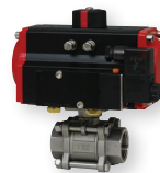
Model SN mounted to an actuator